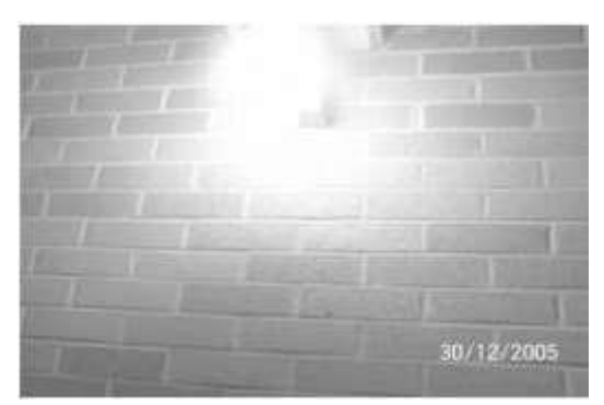
Fig. 3. Shows the luminance enrichment using global parameter x.

The x parameter is different in all regions so the transfer function also defers. The V values whatever determined split into overlapping blocks and the parameter x is calculated using the equation provided by histogram.