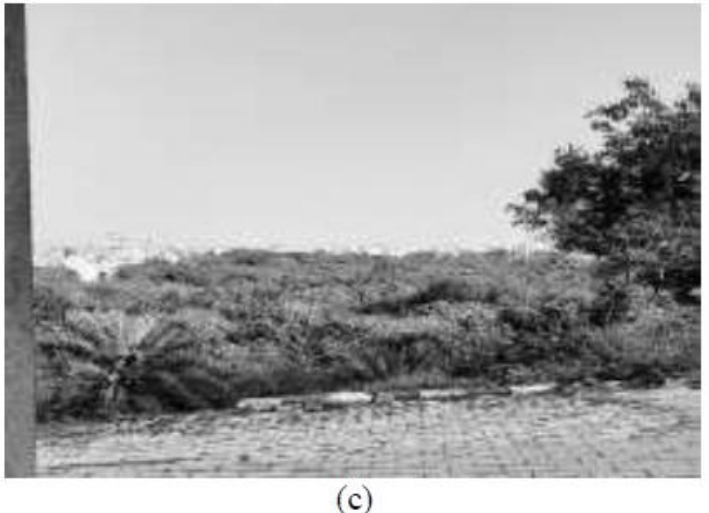
Fig. 5. (a) Source image (b)After luminance enrichment (c) After contrast enrichment.