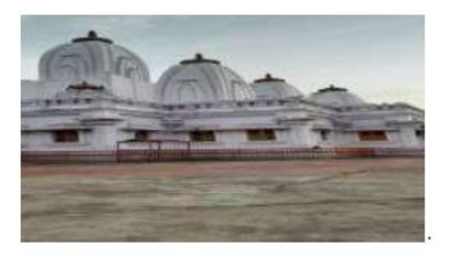
Fig. 6. Original Image